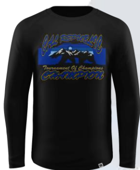
Champion's LS Shirt