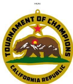
1 st – 4 th Place Custom 5" Medal